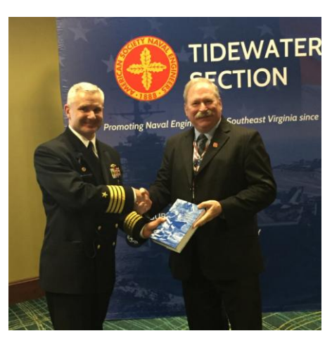
Presentation of speaker's gift